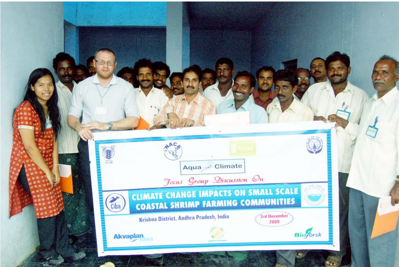
Focus Group discussion at Gullalamoda, Krinshna District, Andra Pradesh